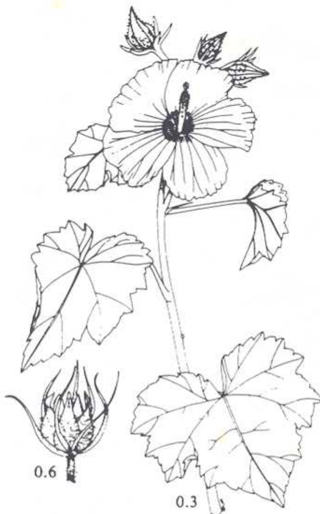
Hibiscus brackenridgei subsp. brackenridgei

ILLUSTRATIONS BY YEVONN WILSON-RAMSEY MANUAL of the FLOWERING PLANTS of HAWAII'I