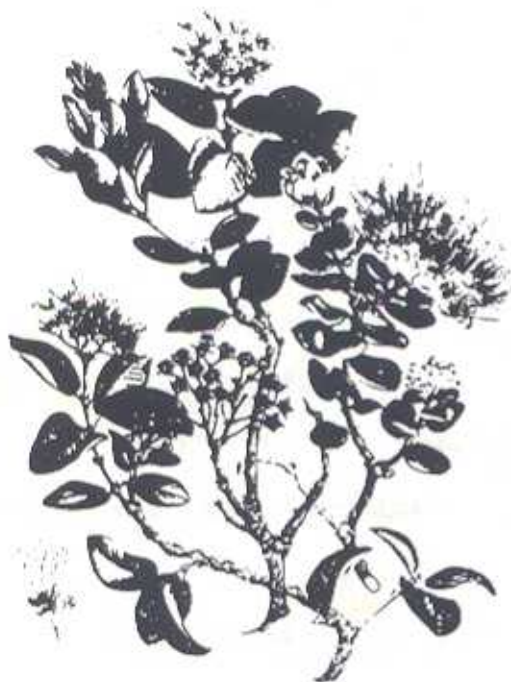
ISABELLA AIONA ABBOTT